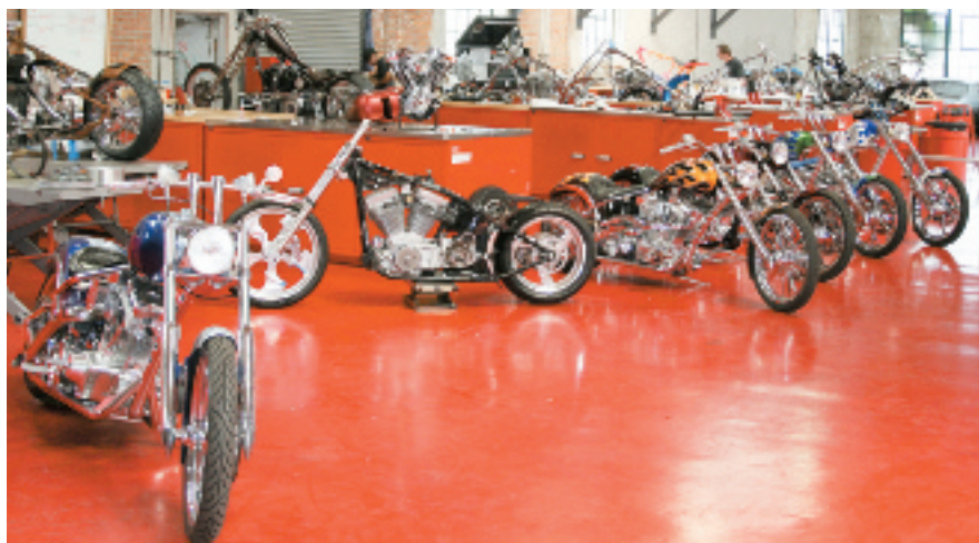
You could spend all day drooling over bikes in West Coast Choppers's Long Beach workshop