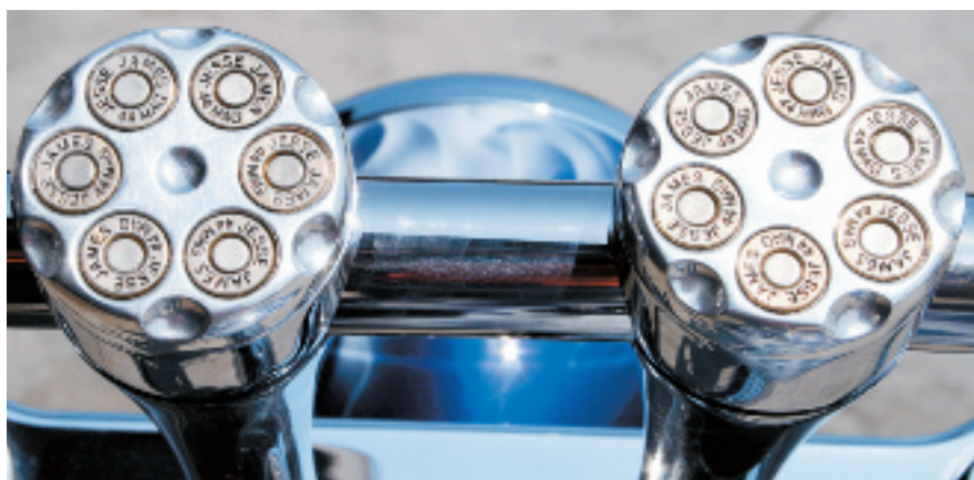
More bang for your buck: replica .44 Magnum bullets are pressed into the handlebar clamps

and my only moment came as I tried a feet up U-turn.