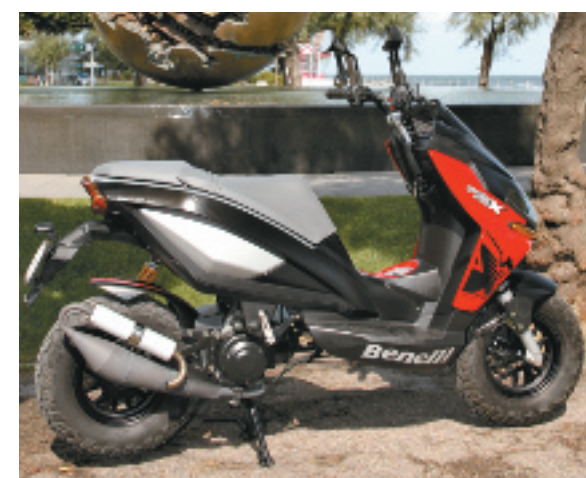
49cc scooter is built by Benelli's Chinese parent company

Engine: Air-cooled 49.26cc (40x26mm), two-stroke, single-cylinder. CVT automatic gearbox. Chassis: Tubular steel frame. 31mm telescopic forks, non-adjustable. Single rear shock, non-adjustable. Brakes: Single 190mm front disc with single piston caliper. 110mm rear drum. Tyres: 120/90x10 front, 130/90x10 rear.