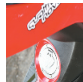
Filler cap apes the superbike