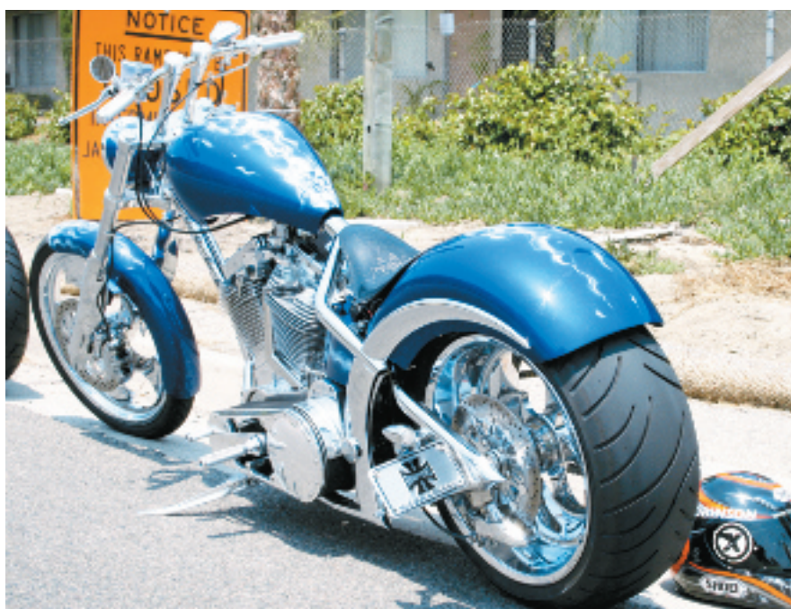
The Jesse James machine might look like a hardtail, but it actually has full rear suspension