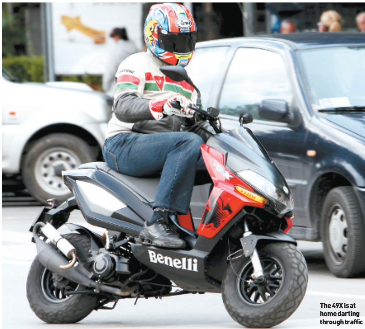
The 49X is at home darting through traffic