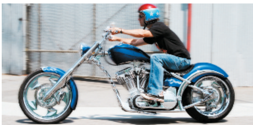
Robinson described the riding position as 'unique' and it's not hard to see what he means