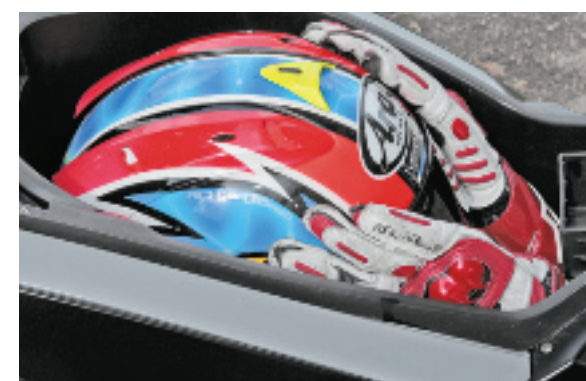
Full-face lid and gloves stash easily under the Benelli's seat